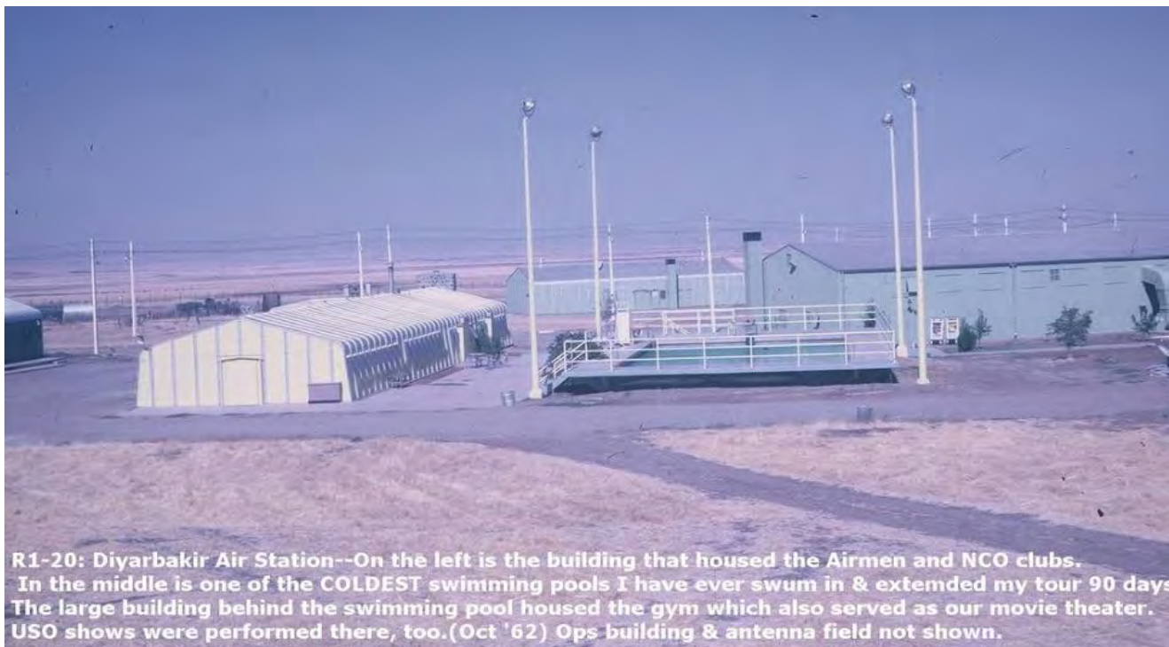
R1-20: Diyarbakir Air Station--On the left is the building that housed the Airmen and NCO clubs. In the middle is one of the COLDEST swimming pools I have ever swum in & extended my tour 90 days. The large building behind the swimming pool housed the gym which also served as our movie theater. USO shows were performed there, too. (Oct '62) Ops building & antenna field not shown.

On the left is the building that housed the Airmen and NCO Clubs. In the middle is one of the COLDEST swimming pools I've ever swum in and made my tour seem 90 days longer! The large building behind the pool housed the gym which also served as our movie theater. USO shows were performed there too. (Oct '62) Ops building & antenna (field not shown). What caught my eye here is that after I got out of AF, I finished college and went to work for AFES (BX business). One of my assignments in 1977 was GM at Karamursel AFB. The compound was still there, but owned by the Turks then. And if you were at Sinop or Diyarbakir, from 1985-87, I ran the exchange system in the middle east and lived in Izmir from where I occasionally traveled to Sinop and Diyarbakir which were both still listening posts at that time.//Bob (Tex) Summerlin//